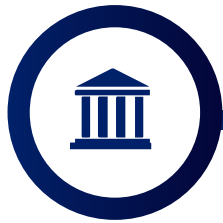
SECURITY GOVERNANCE & CIVIL MILITARY RELATIONS (CMR)

ISG's tailored education and professional development programs support the sustainment of a comprehensive knowledge base and strengthen partner capacities to confront complex security and defense challenges. Engagements are designed to cultivate individual understanding of complex issues, foster peer-to-peer learning, and build international communities of interest.