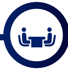
INTERNATIONAL DEFENSE ACQUISITION RESOURCE MANAGEMENT (IDARM)