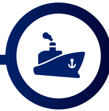
MARITIME SECURITY (MARSEC)