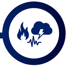
EMERGENCY MANAGEMENT & RESILIENCE (EM&R)