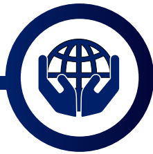
CONFLICT, TERRORISM, & PROTECTION (CTP)