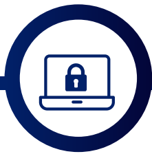
CYBER CAPABILITY (CYBER)