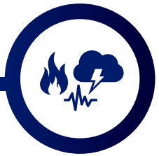
EMERGENCY MANAGEMENT & RESILIENCE (EM&R)