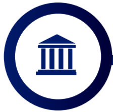
SECURITY GOVERNANCE & CIVIL MILITARY RELATIONS (CMR)

ISG's tailored education and professional development programs support the sustainment of a comprehensive knowledge base and strengthen partner capacities to confront complex security and defense challenges. Engagements are designed to cultivate individual understanding of complex issues, foster peer-to-peer learning, and build international communities of interest.