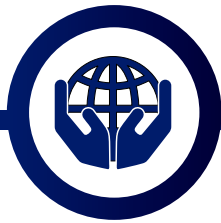
CONFLICT, TERRORISM, & PROTECTION (CTP)