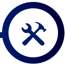
LOGISTICS CAPABILITY BUILDING (LCB)