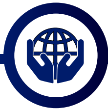
CONFLICT, TERRORISM, & PROTECTION (CTP)