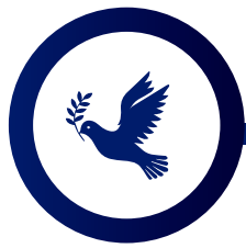
PEACEKEEPING & EXERCISES (PKX)