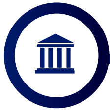
SECURITY GOVERNANCE & CIVIL MILITARY RELATIONS (CMR)

ISG's tailored education and professional development programs support the sustainment of a comprehensive knowledge base and strengthen partner capacities to confront complex security and defense challenges. Engagements are designed to cultivate individual understanding of complex issues, foster peer-to-peer learning, and build international communities of interest.