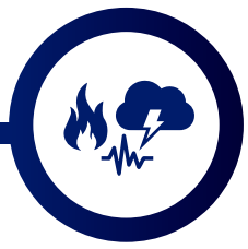
EMERGENCY MANAGEMENT & RESILIENCE (EM&R)