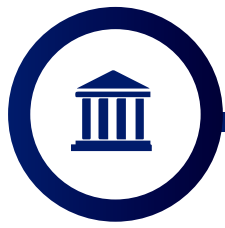
SECURITY GOVERNANCE & CIVIL MILITARY RELATIONS (CMR)

ISG's tailored education and professional development programs support the sustainment of a comprehensive knowledge base and strengthen partner capacities to confront complex security and defense challenges. Engagements are designed to cultivate individual understanding of complex issues, foster peer-to-peer learning, and build international communities of interest.