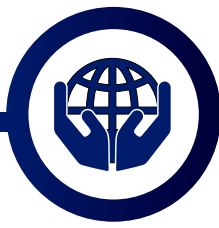
CONFLICT, TERRORISM, & PROTECTION (CTP)