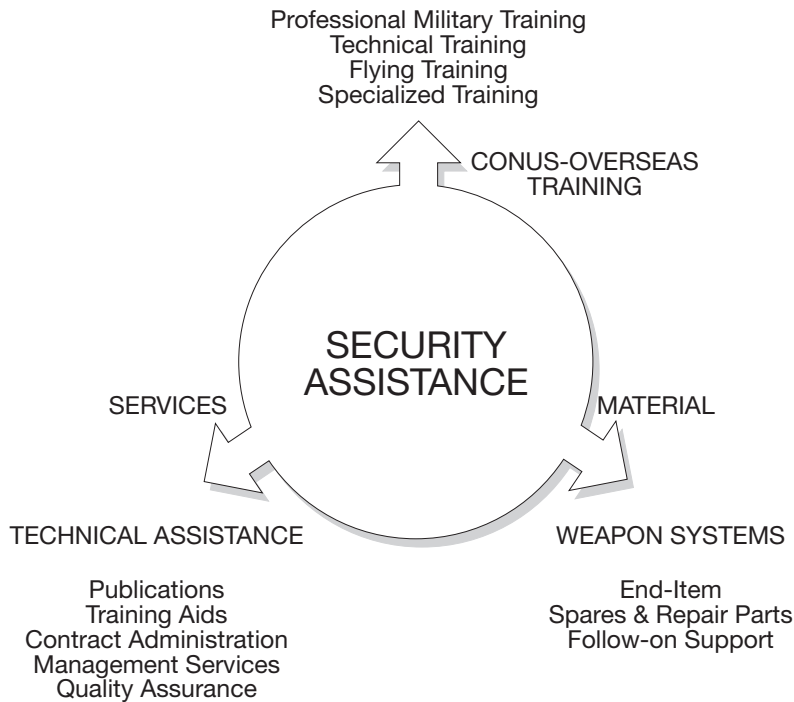
Figure 14-2 Total Package Approach

U.S. Air Force Life Cycle Management and Sustainment Centers. The USAF also includes training in FMS materiel cases managed by its Air Force Life Cycle Management Center (AFLMC) and Air Force Sustainment Center (AFSC). These training lines are still developed, managed, and implemented by AFSAT.