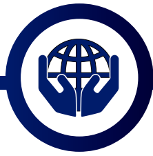
CONFLICT, TERRORISM, & PROTECTION (CTP)