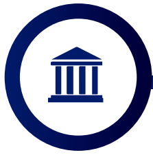
SECURITY GOVERNANCE & CIVIL MILITARY RELATIONS (CMR)

ISG's tailored education and professional development programs support the sustainment of a comprehensive knowledge base and strengthen partner capacities to confront complex security and defense challenges. Engagements are designed to cultivate individual understanding of complex issues, foster peer-to-peer learning, and build international communities of interest.