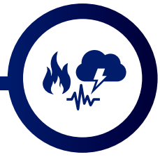
EMERGENCY MANAGEMENT & RESILIENCE (EM&R)