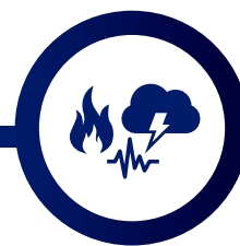
EMERGENCY MANAGEMENT & RESILIENCE (EM&R)