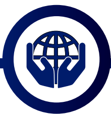
CONFLICT, TERRORISM, & PROTECTION (CTP)