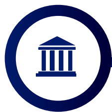
SECURITY GOVERNANCE & CIVIL MILITARY RELATIONS (CMR)

ISG's tailored education and professional development programs support the sustainment of a comprehensive knowledge base and strengthen partner capacities to confront complex security and defense challenges. Engagements are designed to cultivate individual understanding of complex issues, foster peer-to-peer learning, and build international communities of interest.